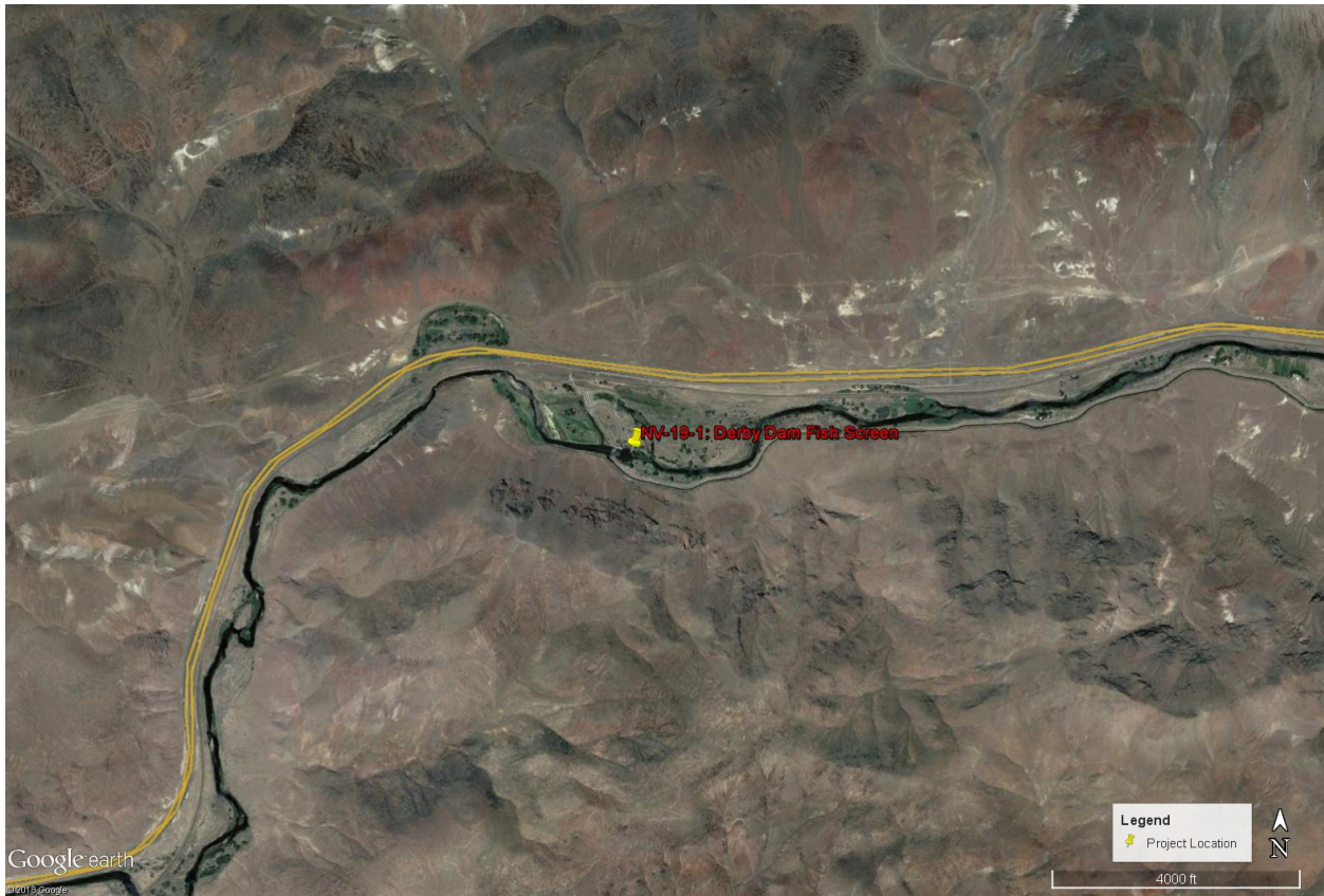
Figure 2. Map of the proposed project location.