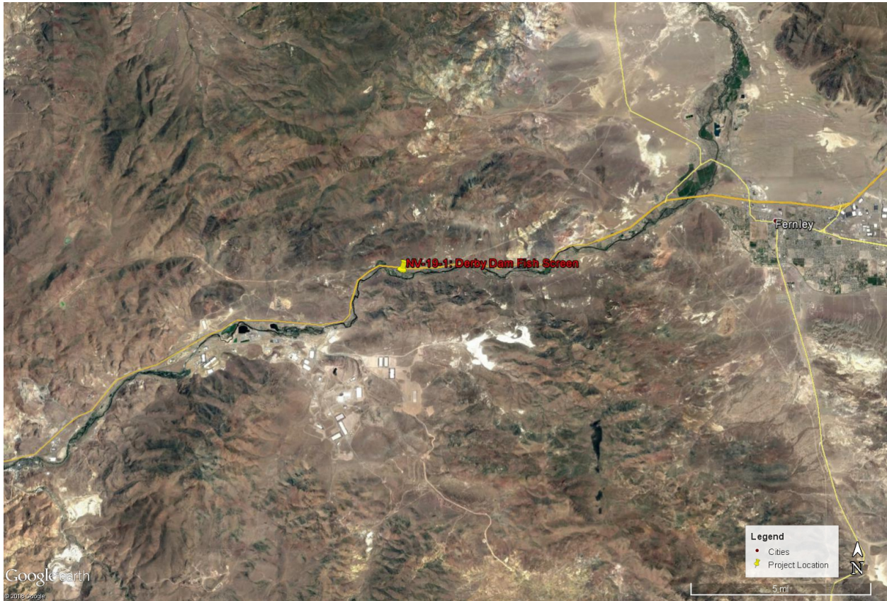
Figure 1. Vicinity map.